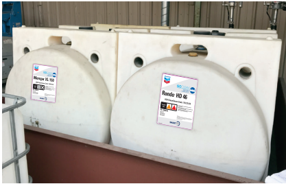
Chevron SmartFill™ labels ensure the correct Chevron Certified lubricant is installed.