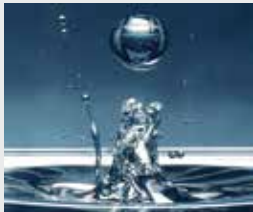
Premium Base Oils