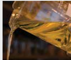
Caltex Formulation Expertise