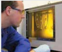
High Performance Additives